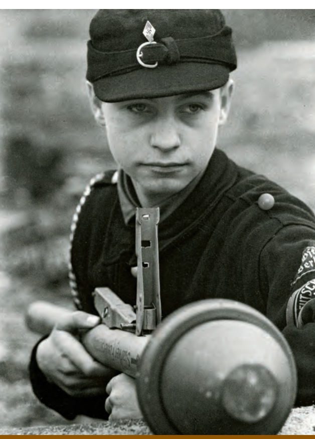
In the Hitler Youth, boys received military training and fought mock battles. They were being trained as future Nazi leaders.