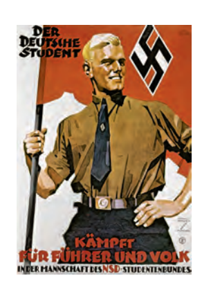
This 1930s Nazi poster reads "The German student fights for the Führer and the people." What message does this poster send?

In the final months of 1941, the boys stepped up their resistance. They became more confident and more daring, churning out more