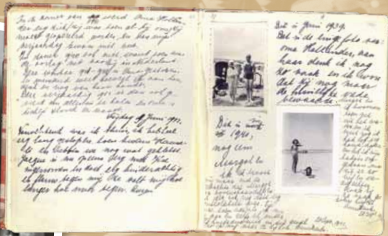
This is Anne's diary. She named her diary Kitty and wrote each entry as a letter.